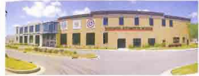
Wisconsin Automotive Museum 147 North Rural Street Hartford, WI 53027 262-673-7999

(Kissel files will be available to members to view and make copies during the weekend)